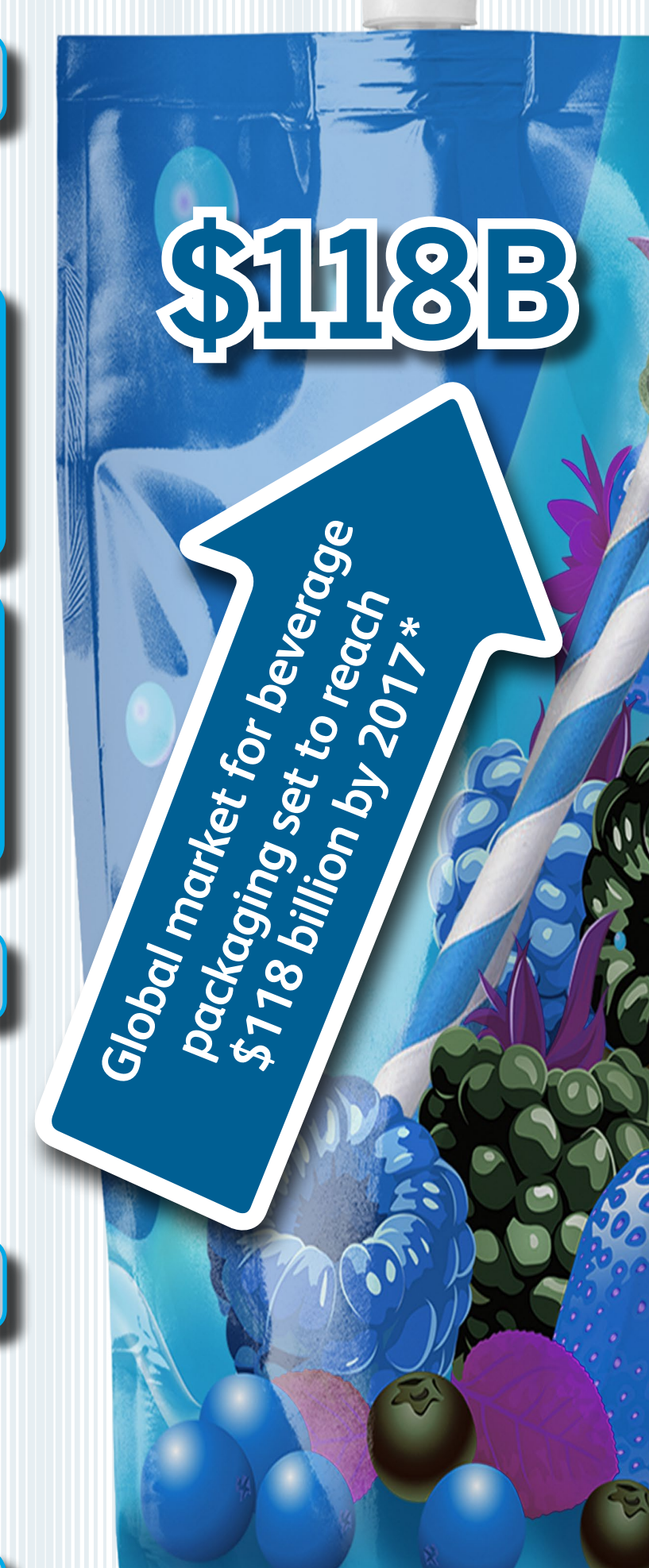
*www.globalprocessingmag.com, April 28, 2015

Empty pouches are lighter and less bulky to transport.